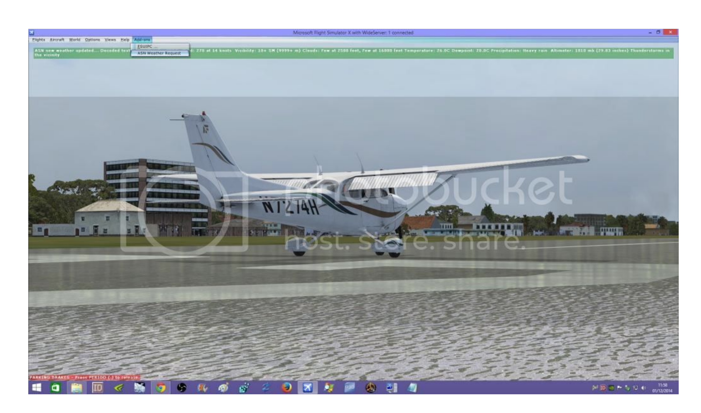
Rex Essential Plus Overdrive Prepar3d Crack